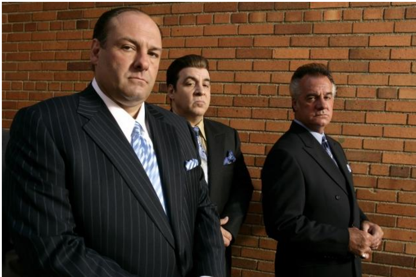
Tony Soprano and associates from the television series "The Sopranos".