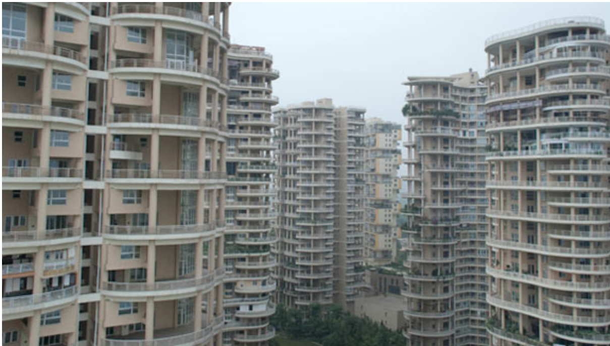
Chengdu Apartment buildings.

A perfectly stunning number of clusters of apartment buildings like these swarm on the horizon. The only round-eye I met who lived in one said that her apartment was quite nice.