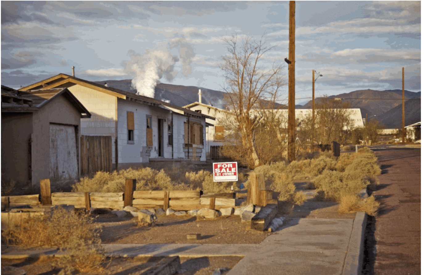
Home for sale in Trona.

You see, while America was squandering trillions of dollars blowing up mud huts, and shooting goat herders with ultra-expensive weapons systems, the rest of the world was spending the money on domestic needs. China has taken that money and invested it in people, families, culture and society.