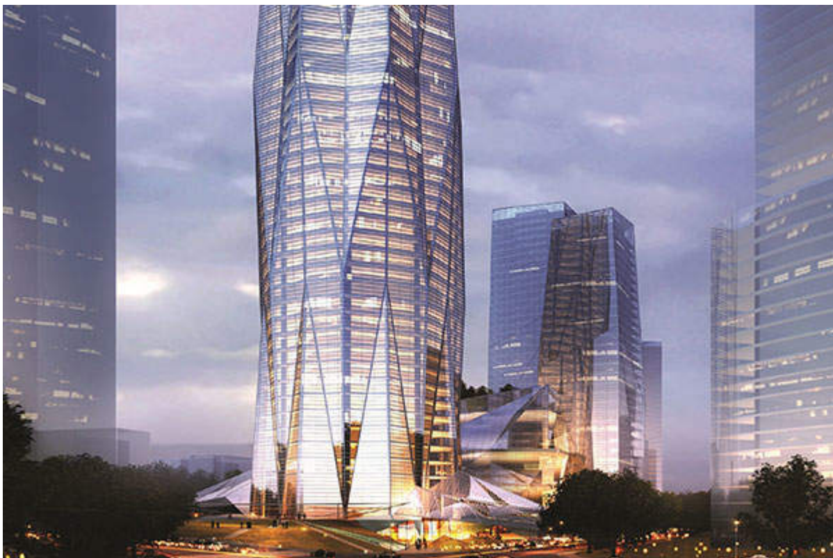
Downtown tower in the enormous downtown city center.

Many criticisms may be made of the Chinese government, some of them valid, but no other government has lifted so many people out of poverty so fast.