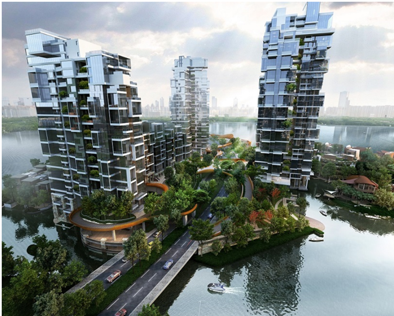
Chengdu nature integrated apartments.

A characteristic of the Chinese is that there are lots of them.