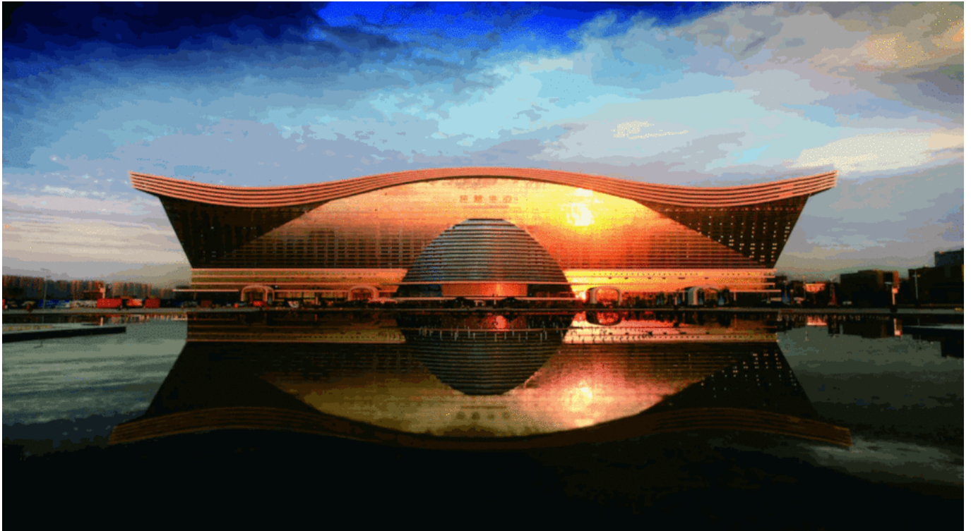
The Chengdu Global Center.

It is the damndest thing I have ever seen, maybe.