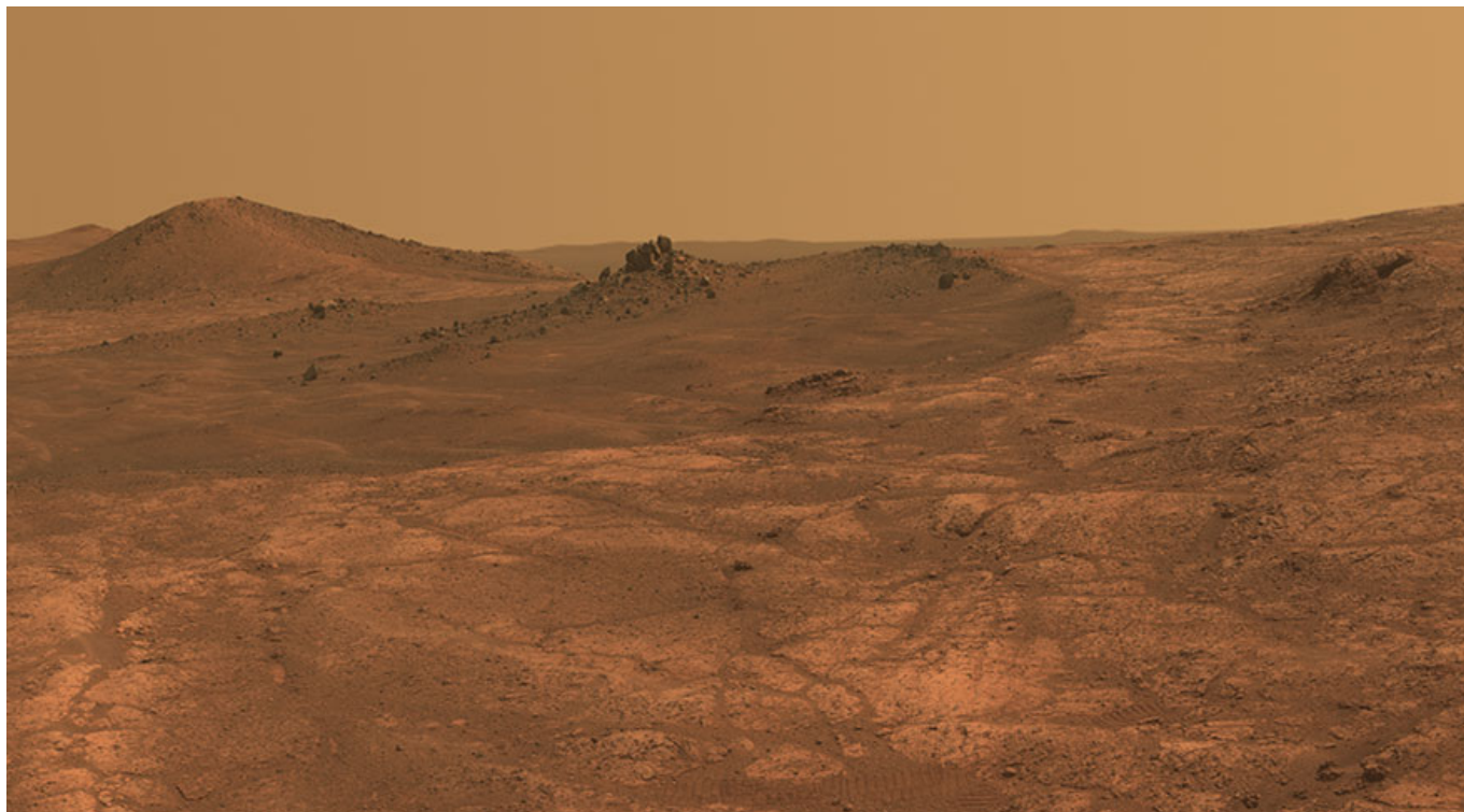
The actual surface of Mars within a 2% world-line variance.

It is mostly rocks with some frozen liquids in the shape of crystals scattered about. There once was flowing water on the planet, but it was geologically a long; long time ago [ii] . And, when the water did flow there was not enough time [iii] for any kind of evolutionary process to take place. There are no statues, or ruins on Mars suggestive of a great glorious human-compatible civilization. There are no carved faces the size of mountains on the planet. There are no statues or fossilized bones or remains to be seen.