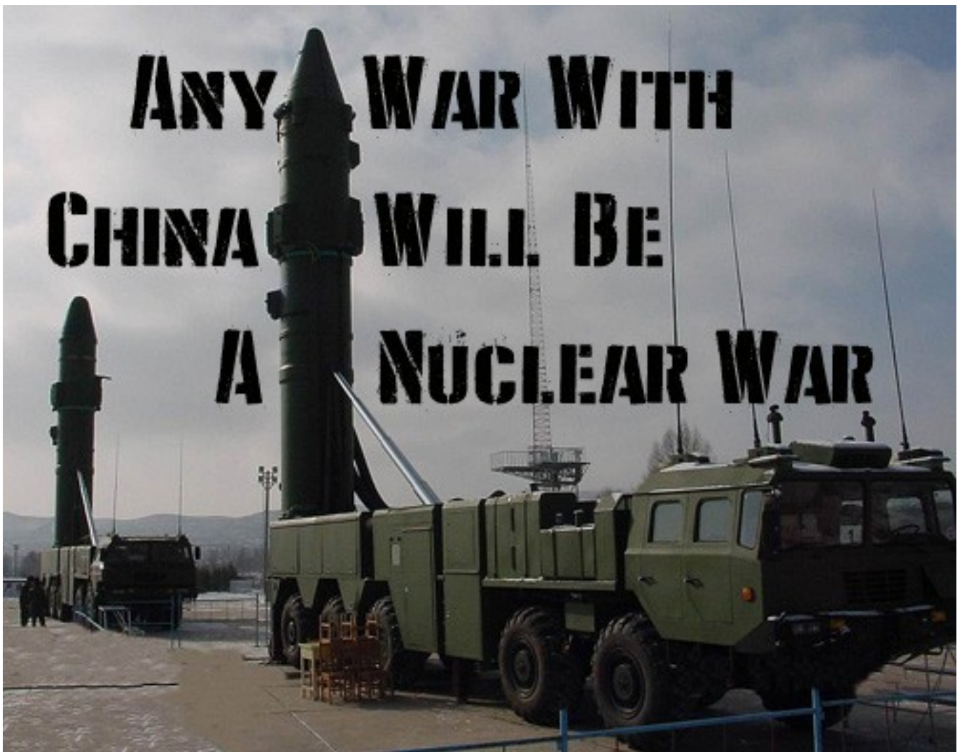
Any War With China Will Be a Nuclear War

If the war between the US and China started going badly for one side or the other, how long would they wait to move on from the conventional weapons and bring out the heavy artillery? It is more likely that such a war would be over in a few days as it quickly turned into a full-on nuclear exchange between Russia and China and the US.