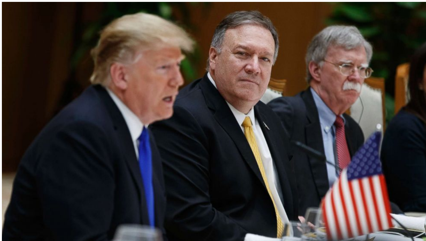
Trump, Pompeo and Bolton.