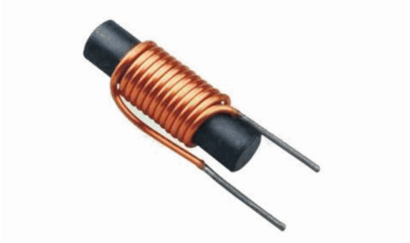
R Type EMI Rod Ferrite Core

The moment that an electrical current enters the wire and the turns of wire around the ferrite core, a magnetic field develops. Then it ends.