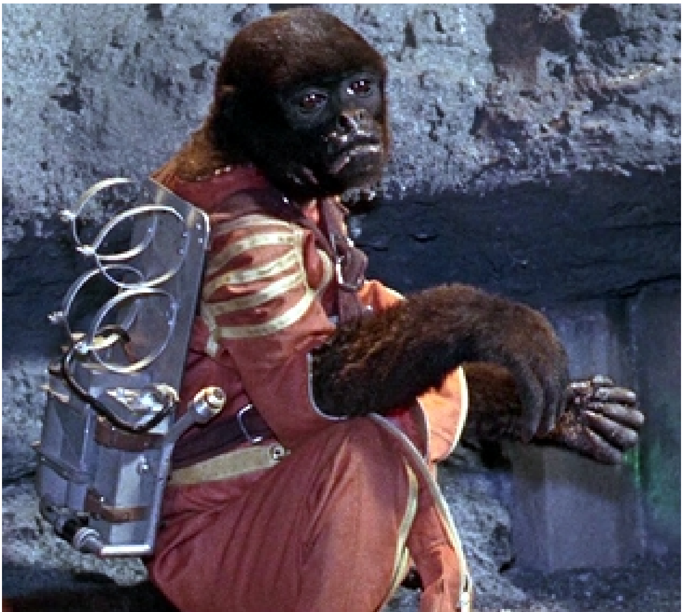
The true hero of the movie; the space-suited monkey Mona.

Despite its retro rockets, Draper's ejection capsule crashes on landing, wrecking the craft and leaving food and water for only a few days. Exhausted, Draper falls asleep only to wake up suffocating for lack of air. Without oxygen, he can sleep only an hour.