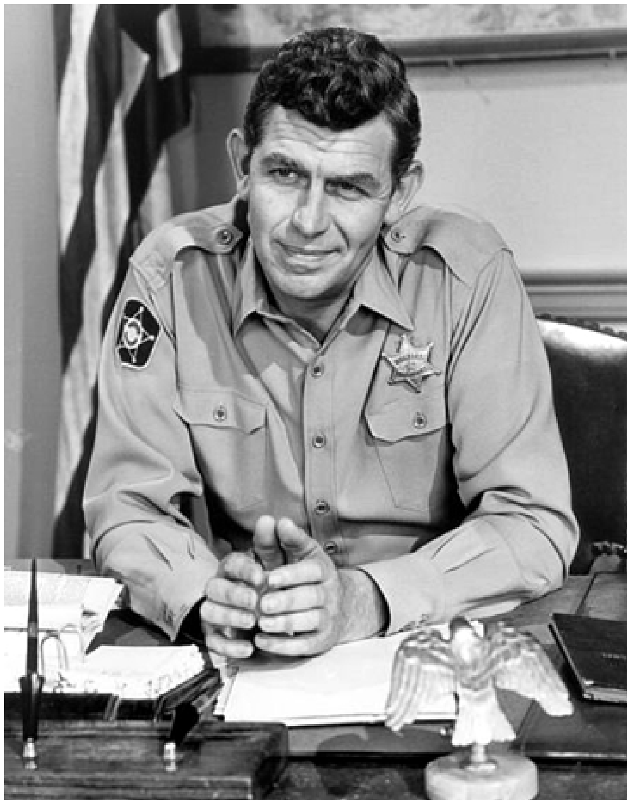
Sheriff Andrew Jackson Taylor

When Andy Griffith decided to call it quits with the show it was still popular and the network decided to carry it on under the new name of Mayberry RFD with Ken Berry in the lead as councilman Sam Jones.