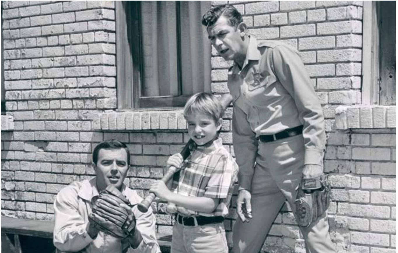
A typical day in Mayberry with Andy and councilman Sam Jones.

Griffith helped with the change over by appearing in the first episode (it was in this episode that he married Helen and the pair then moved away from the town).