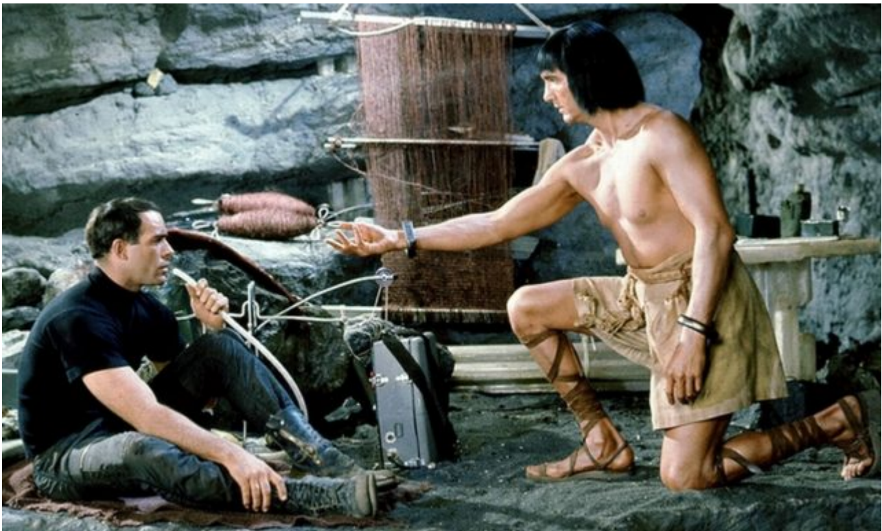
Robinson Crusoe on Mars (1964)