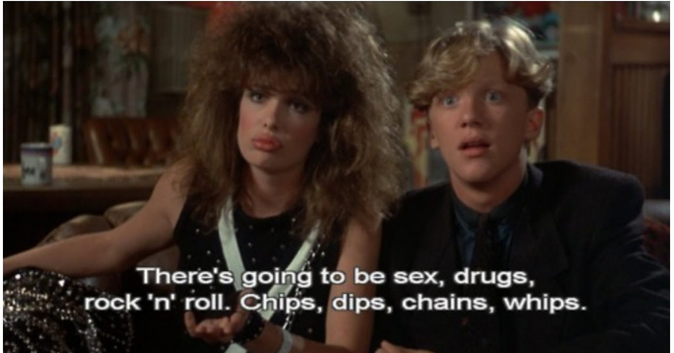
Weird Science (1985)

Triumphant geeks have always been a common theme of writer/director John Hughes, but that triumph was never achieved as raucously as it was in 1985's Weird Science – a screenplay which took the high school movie guru just two days to write.