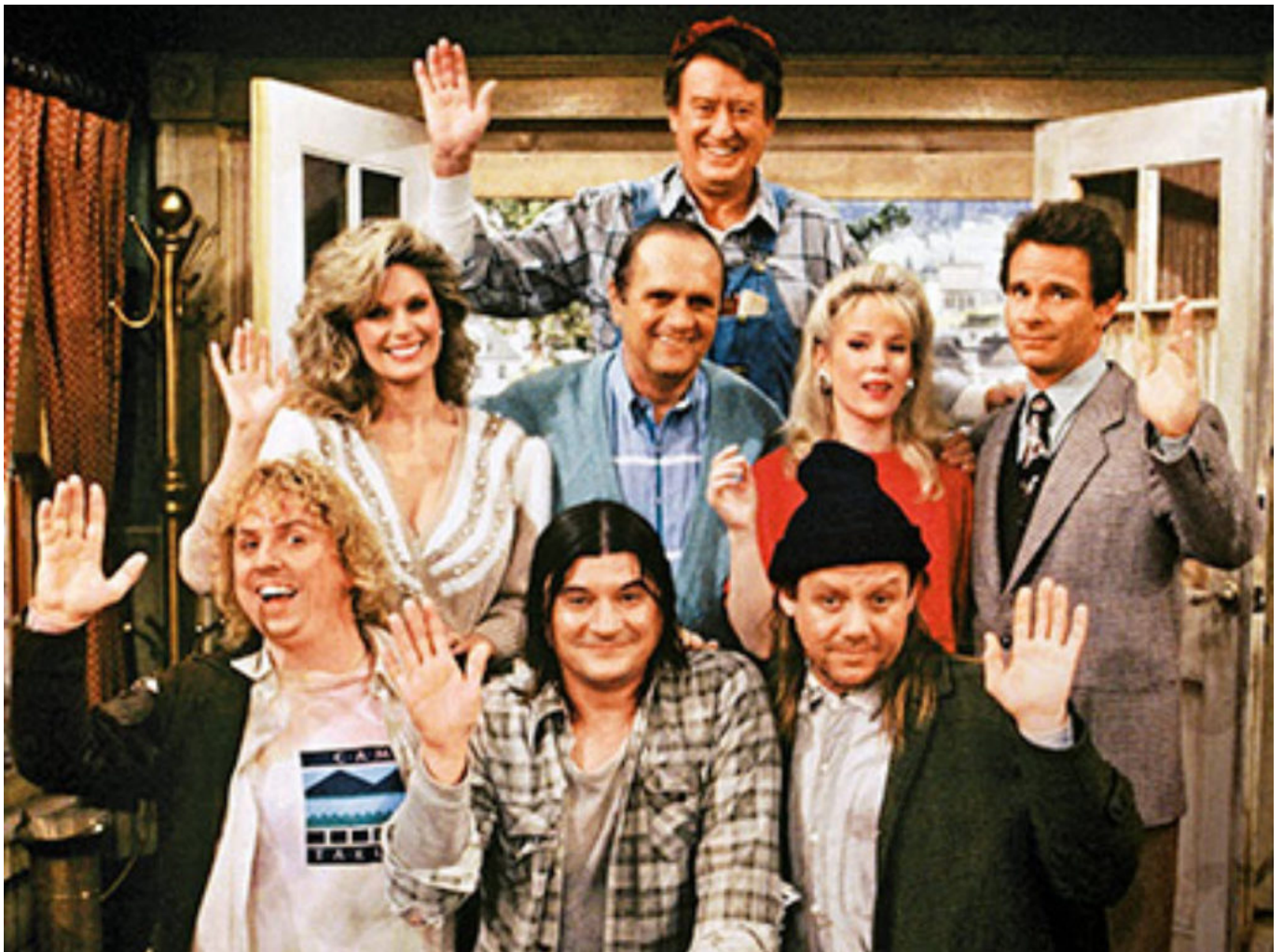
The cast of the television show "Newhart".

If you have lived through the 1980's then you knew all about Newhart. This show as a hoot!