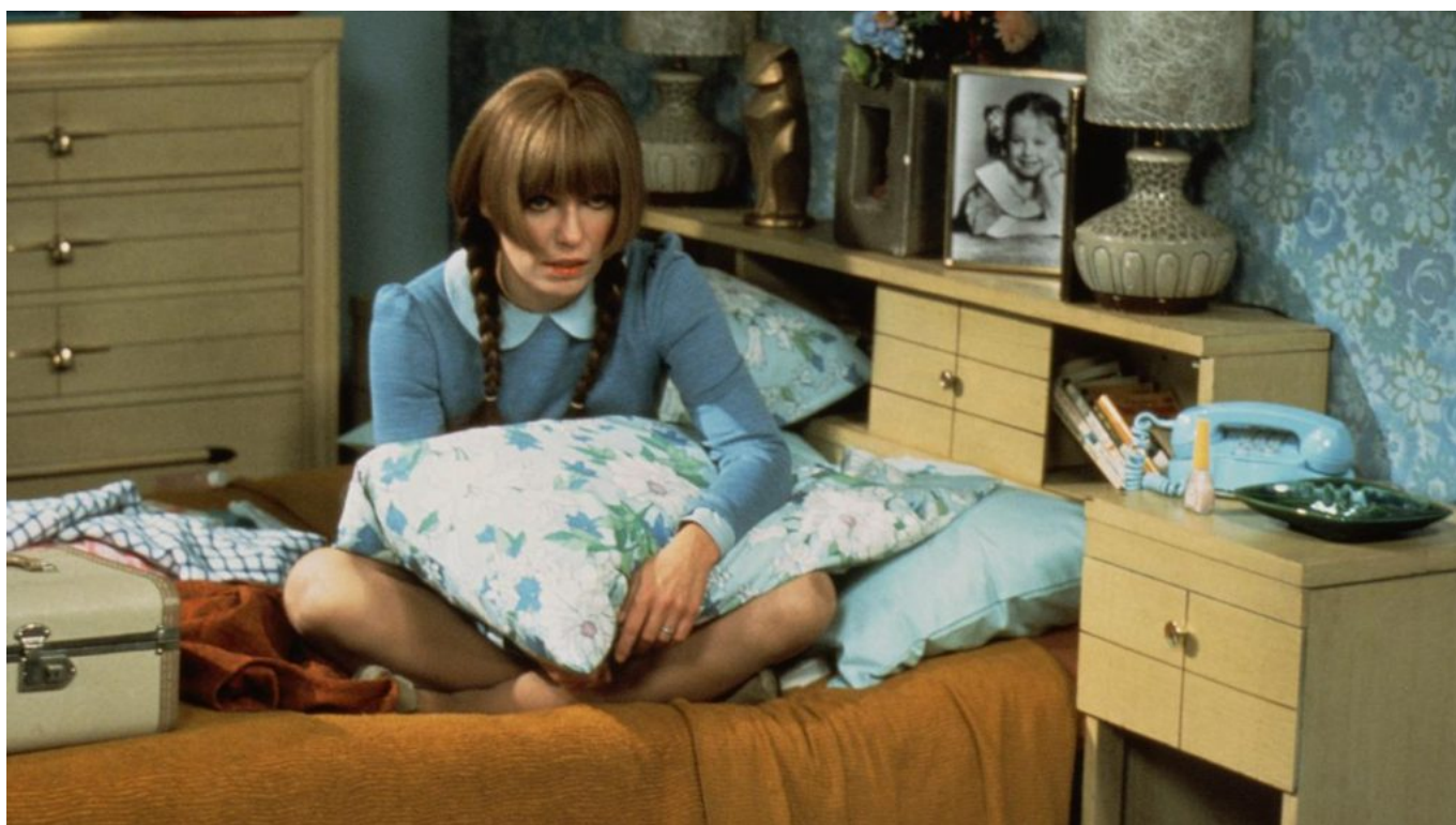
Mary Hartman. Mary Hartman.

A more insightfully absurd and comically astute series has not been made. Mix the daily grind of ALL MY CHILDREN, the experimentation of MONTY PYTHON, the self-absorbed and urbane existentialism of WOODY ALLEN and the offbeat quality of BLUE VELVET and you have MARY HARTMAN MARY HARTMAN.