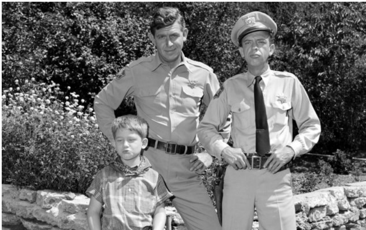
The Andy Griffith show.

This sitcom was spun-off from an episode of The Danny Thomas Show. In that show, Danny Thomas was arrested in a small North Carolina town. The character of the small town sheriff turned out to be so popular that they made a complete show around him.