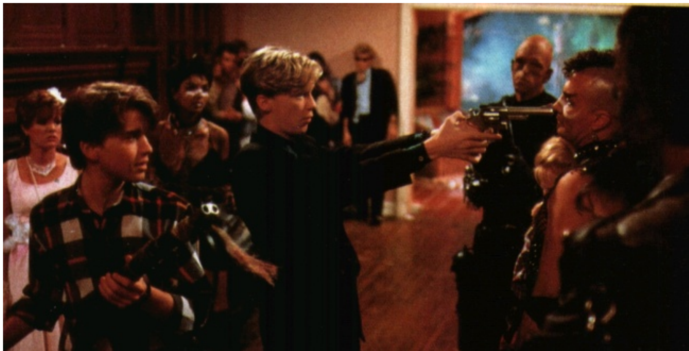
Weird Science (1985)

But most importantly, she teaches Wyatt and Gary how to stand up for themselves – which in this case, means facing off against the gun-toting, wedgie-bestowing older brother Chet (Bill Paxton), and, as if that's not bad enough, a beastly biker type (played by Vernon Wells, reprising his Mad Max 2 role).