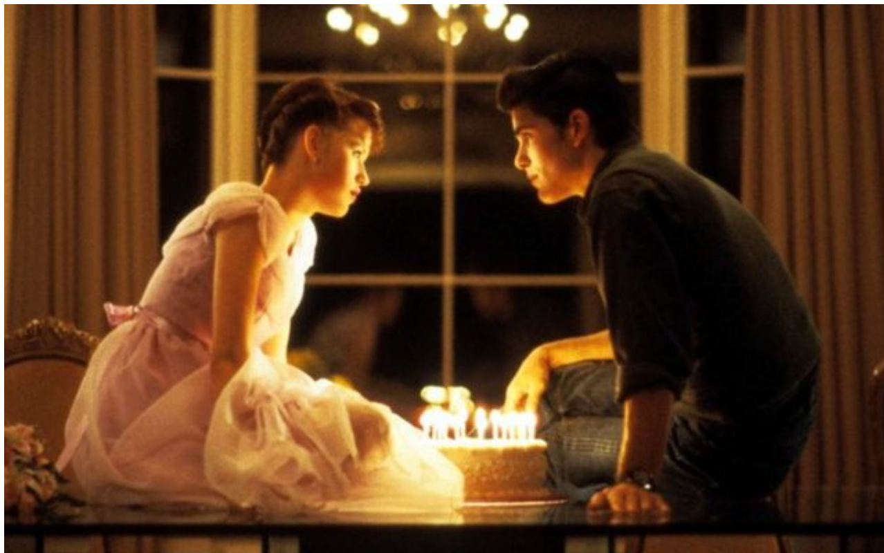
Climax of the movie when Samantha gets her birthday wish.

The tale is classic. American teenager Samantha (Molly Ringwald) is despondent that her entire family has forgotten her sixteenth birthday. You know, being so caught up are they in the wedding of her sister. Now, Samantha has a crush on a classmate of hers. He's Mr. Bo-Hunk; Jake Ryan (Michael Schoeffling), and she wrongly thinks he has no interest in her.