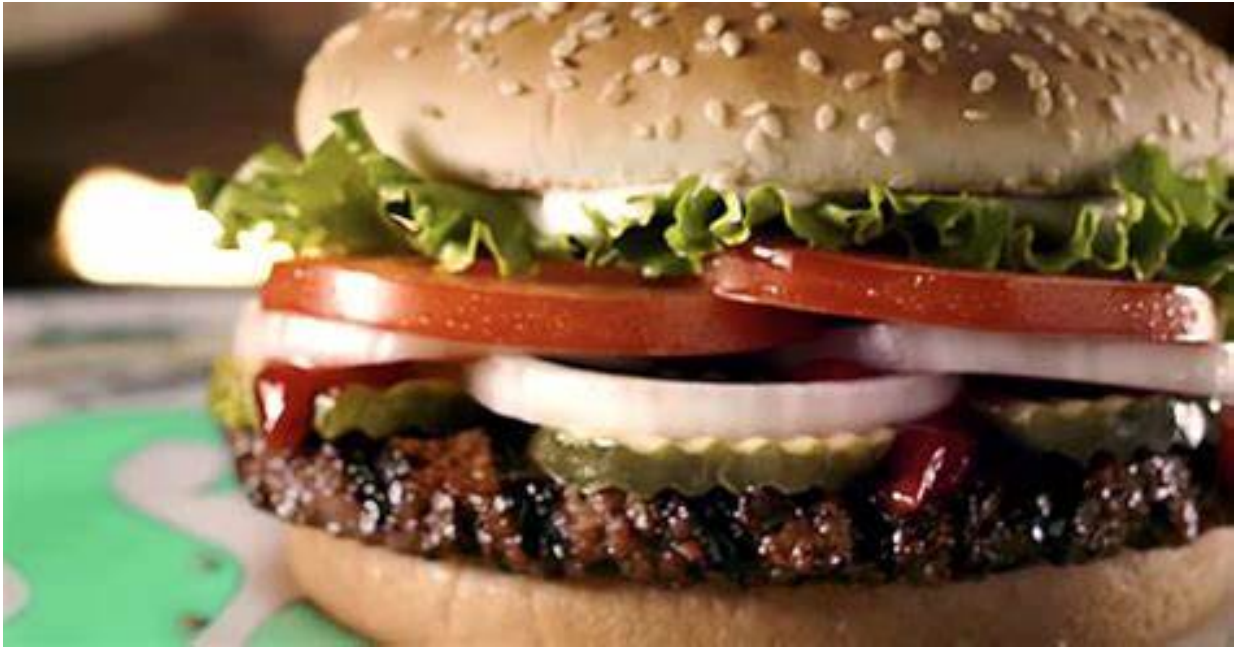
Burger King's Whopper.