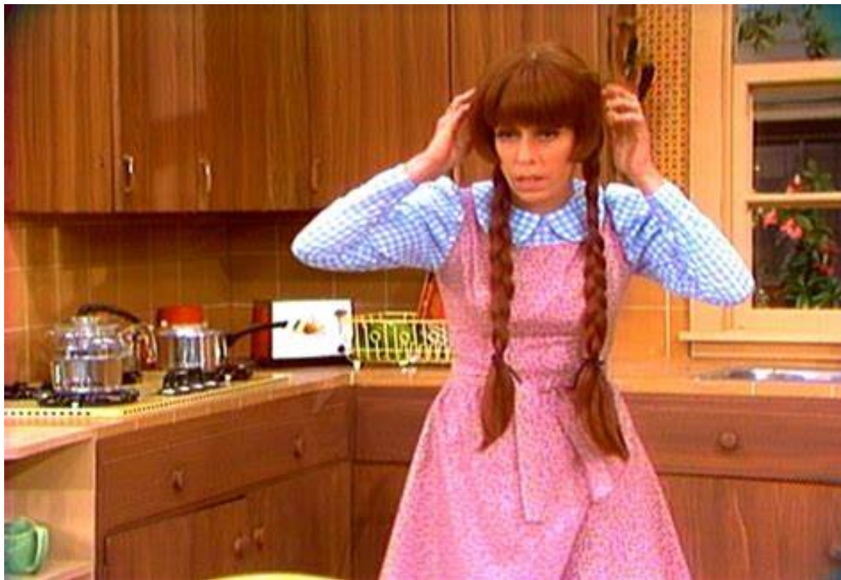
Mary Hartman. Mary Hartman.

Set in fictional Fernwood, Ohio, this deliriously demented serial focused on the beleaguered heroine Mary Hartman, an average American housewife. In the first season, Mary suffered the travails of mass murder, adultery, venereal disease, homosexuality, religious cults, and UFO sightings, before she finally succumbed to a nervous breakdown on a syndicated talk show.