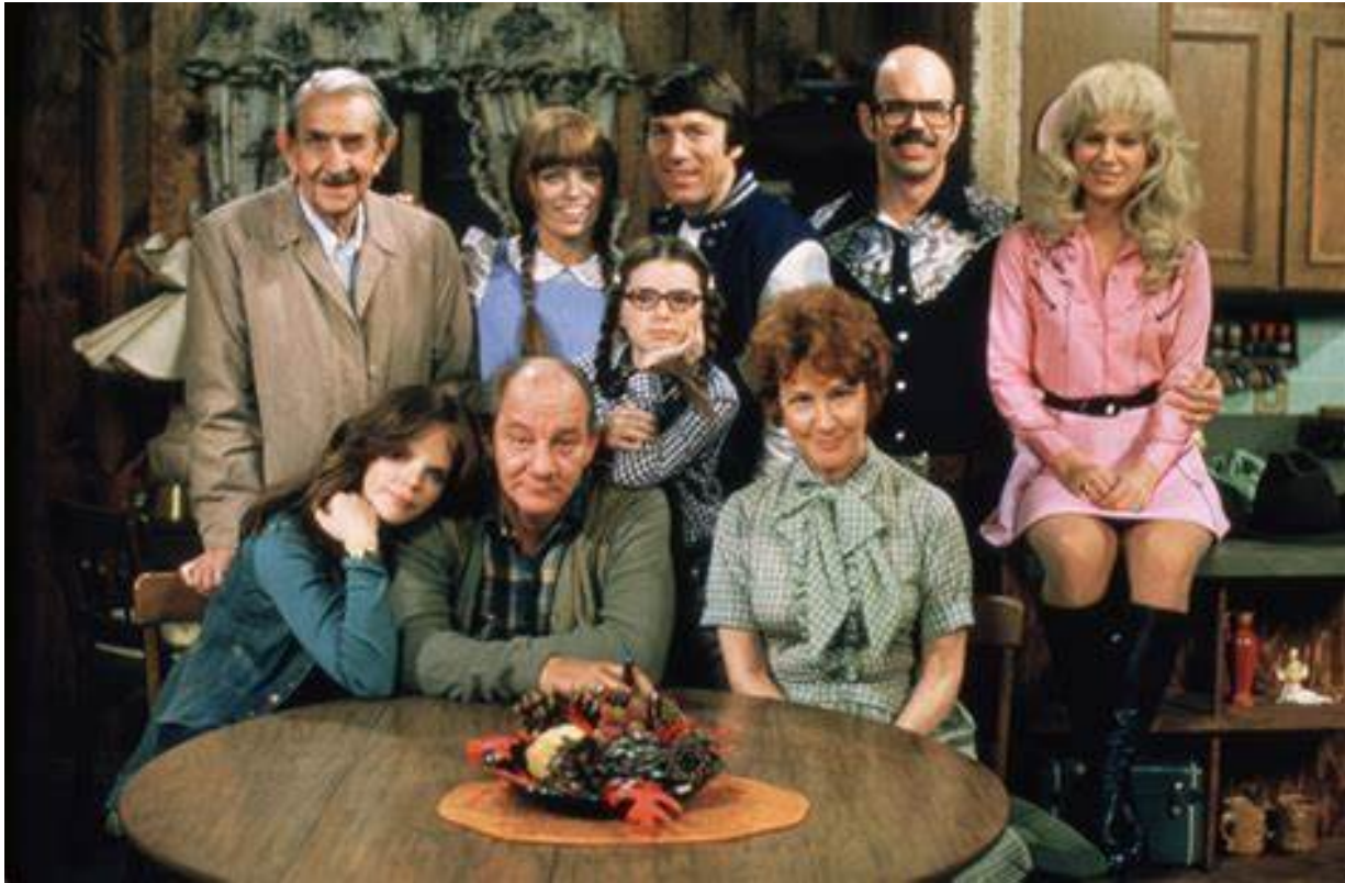
Mary Hartman. Mary Hartman.

Her confrontations with adultery, contemporary feminism, and countless other social issues (often found within her own family) while trying to be the perfect little housewife and mother makes her eventual nervous breakdown more than just another crazy plot twist.