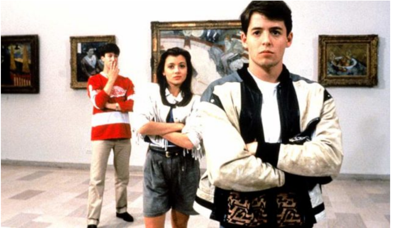
Ferris Bueller takes a day off from school.

Ferris Bueller (Matthew Broderick) is a born con artist. When he's not talking a mile a minute to his girlfriend Sloane (Mia Sara) and his best friend Cameron (Alan Ruck), he's stepping aside, facing the camera and addressing the audience.