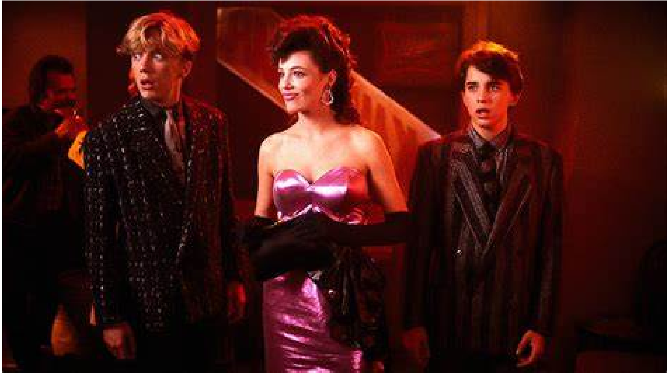
Lisa, the Frankenstein creation of two 1980's nerds.

But with the lightning brewing outside, the bras atop their heads and the Barbie doll hooked up to the hardware, it's inevitable the boys take things a little too far . . .