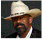
Sheriff David Clarke, Ret.

Since 2016, I learned a valuable lesson when any time a New York Times, Washington Post, or USA Today story says, "Sources tell us," I replace those words with these three words: "it didn't happen." I know I am not alone with my thinking. After several years of fake news, we learn how to read through the nonsense.