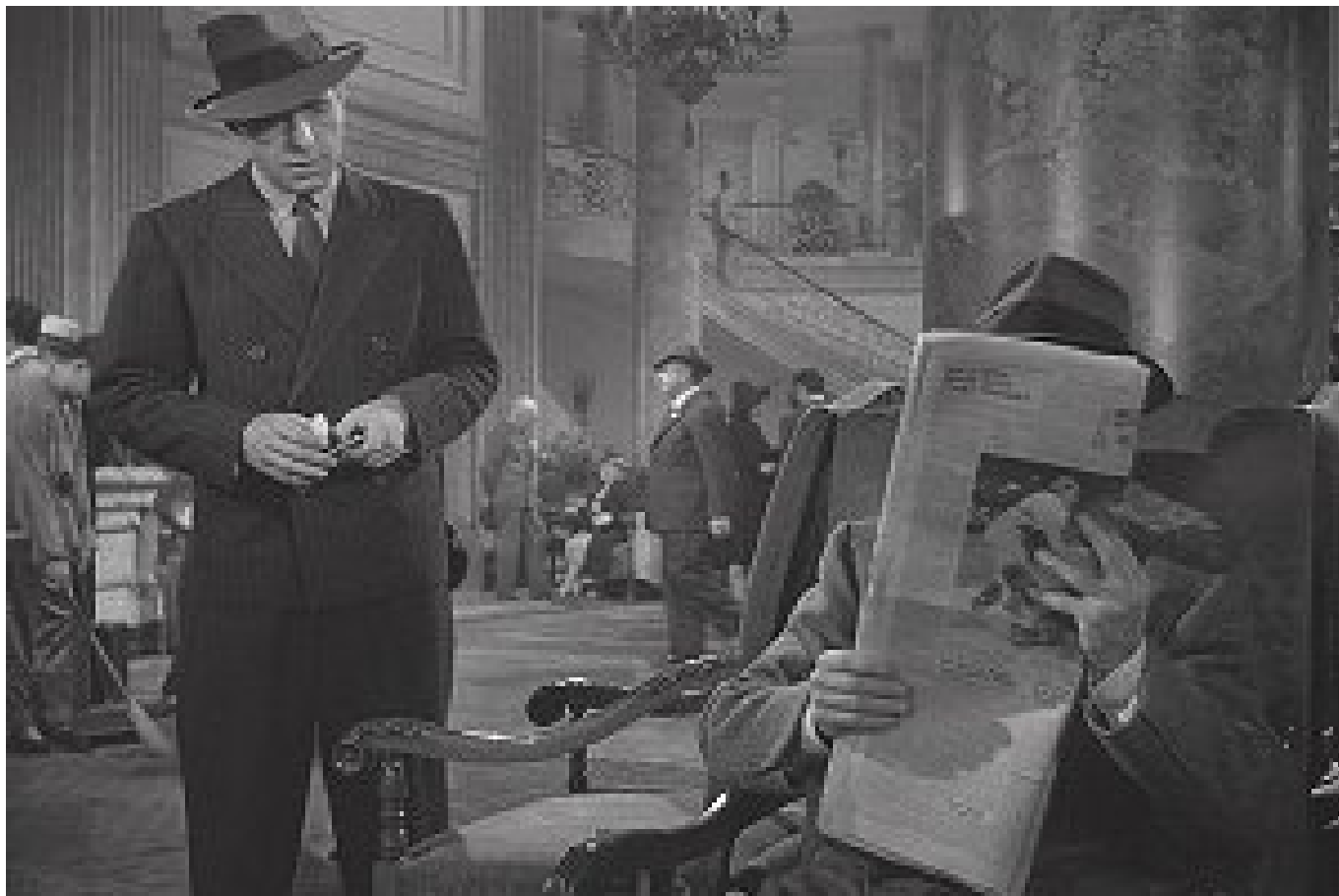
Scene from the Maltese Falcon.