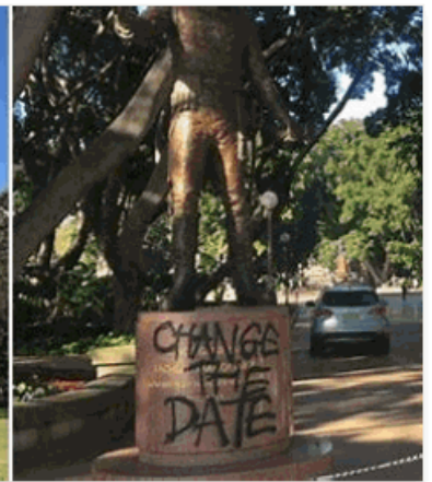
Destruction of Statues in America in 2020.

After the Bourbon Restoration, the kings were retrieved from the pit and moved to the crypt in the basilica, but the damage was already done: many of the kings were unrecognisable.