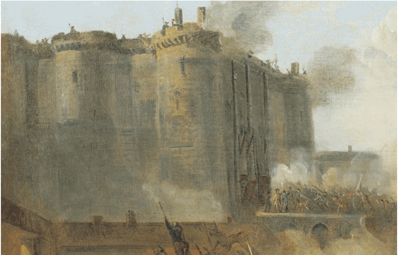
Storm the Bastille!

The Bastille was a literal fortress. It was a tall dark fortress with an enormous dungeon that symbolized the monarchy's absolute power, and the citizens of Paris were about to tear it apart, quite literally brick by brick!