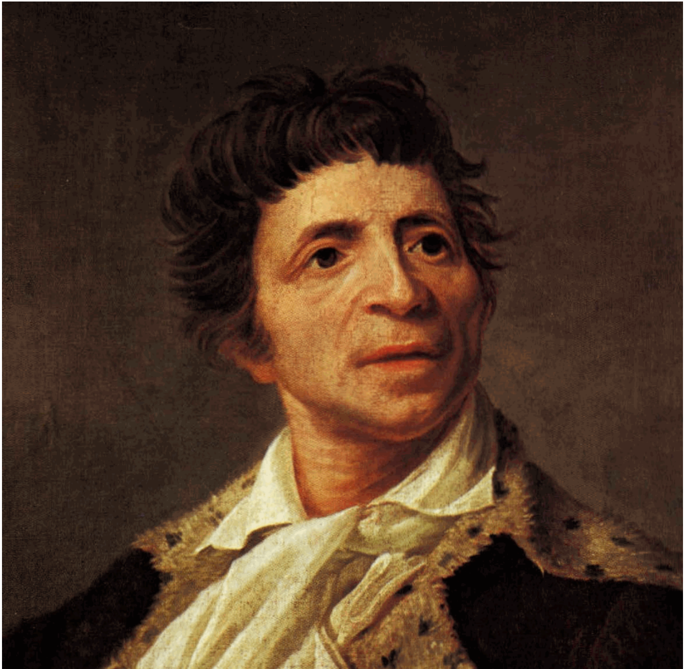
Jon Paul Marat

All the while, Jon Paul Marat became the voice of the Revolution. As it turns out, Marat was a voice of insanity .