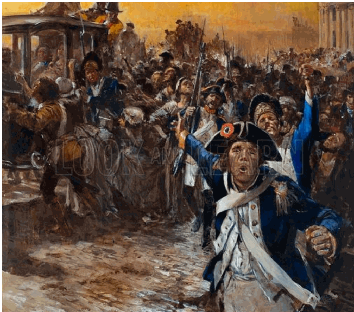
The Reign of Terror.

In 1791, the King and Queen attempted an escape to Austria, disguised as servants. Unfortunately they kinda sucked at acting. They were found out, arrested, and dragged back to Paris to await trial.