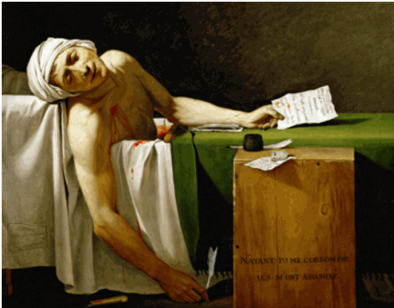
Jon Paul Marat's famous death.