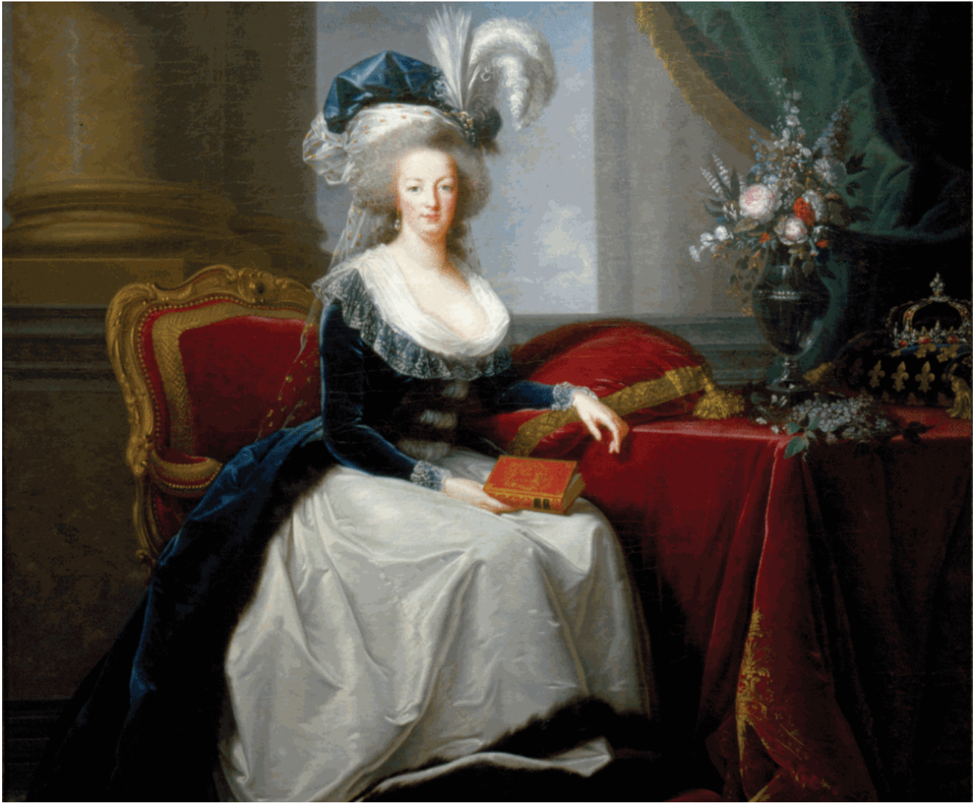
Marie Antoinette: Madame Deficit

Meanwhile, back in the real world: France was simmering in a toxic mixture of hunger, and anger.