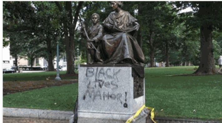
Destruction of Statues in America in 2020.

But within a month they were hammering into the old vault that held the kings from the House of Bourbon.