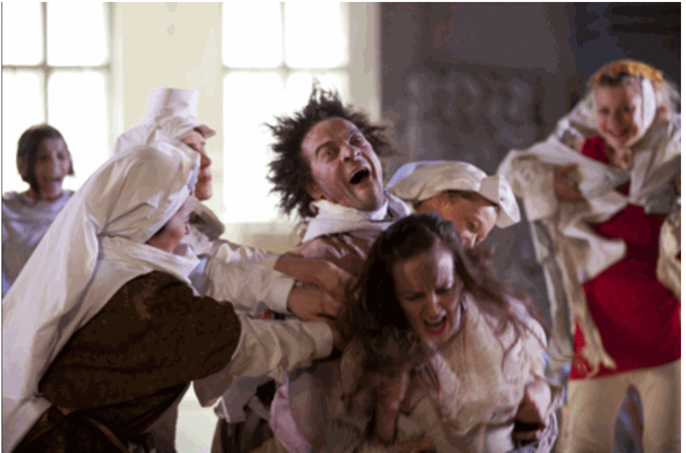
Reign of Terror

This period is now known as the Reign of Terror, and it resulted in thousands of innocent deaths.