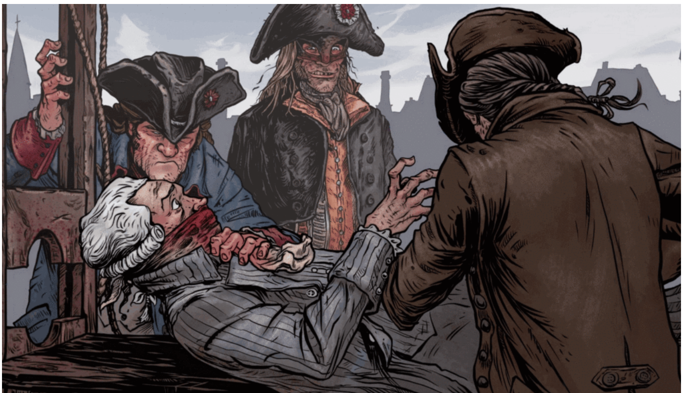
The Nations Razor.

The Guillotine was placed in the center of a town square in Paris, for all to see. This unsanitary death-dealing device soon became the bloody symbol of the French Revolution, with a name that evokes a cross between a pro-wrestler and a death-metal band: "The Nation's Razor"!!