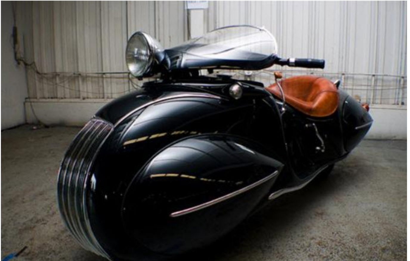
1930's Art Deco Henderson Motorcycle