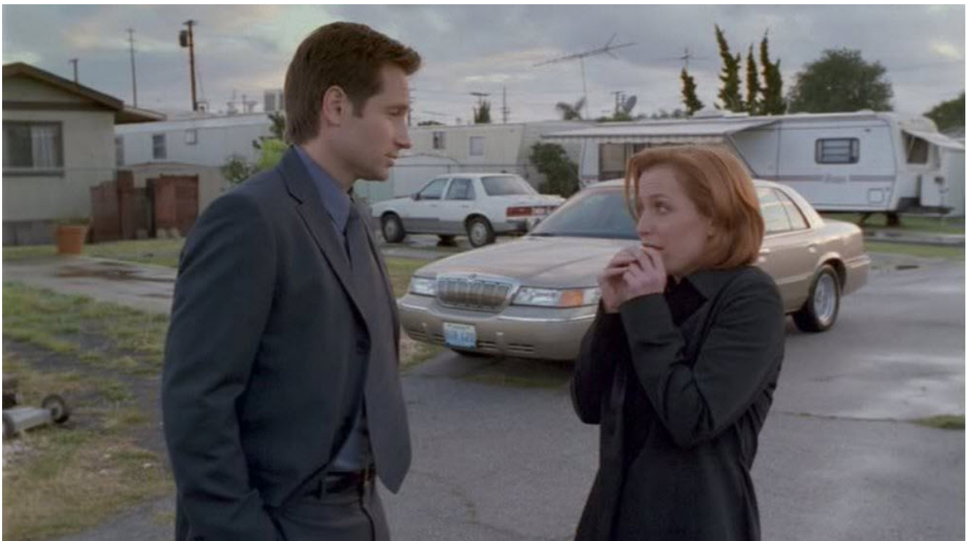
X-files episode titled "Je Souhaite".

Our wishes and our dreams are always based upon our experiences and what we know.