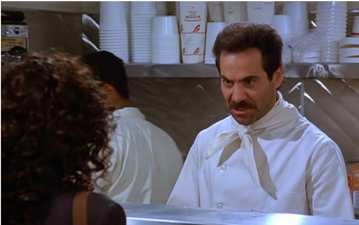
Soup Nazi, from the television show "Seinfeld". "No Soup for You!"

It is not often that we know who created a particular word, despite the claims that are made about such-and-such writer inventing this-or-that word; such claims are usually false. In the case of smellfungus , however, we not only know who coined the word (Laurence Sterne), we also know who it is supposed to represent (Tobias Smollett).