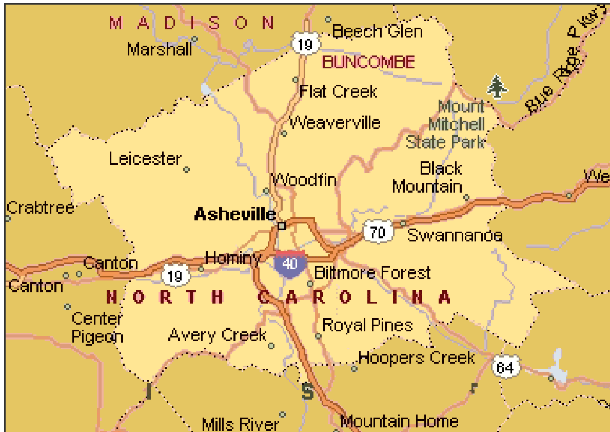
Buncombe, North Carolina.