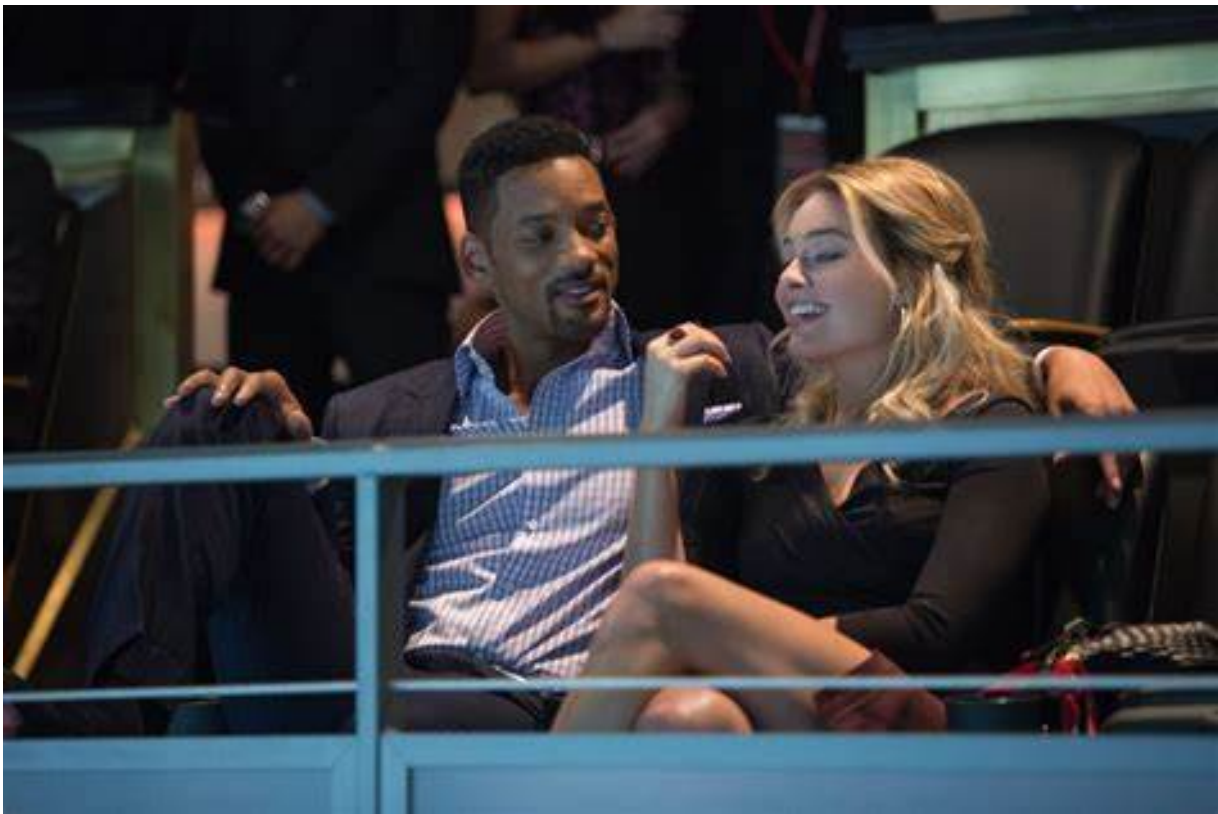
Will Smith in the movie "Focus".