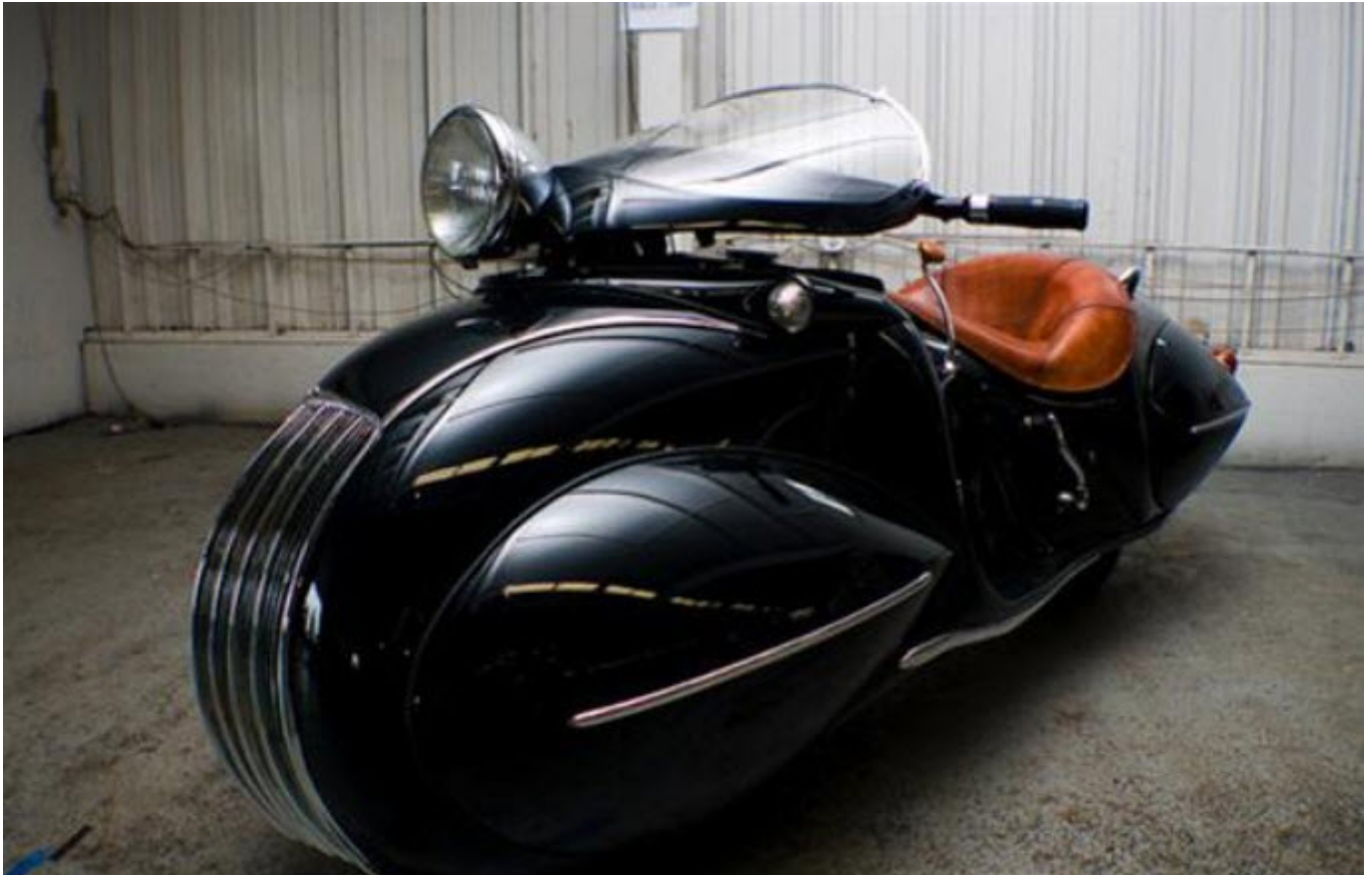
1930's Art Deco Henderson Motorcycle