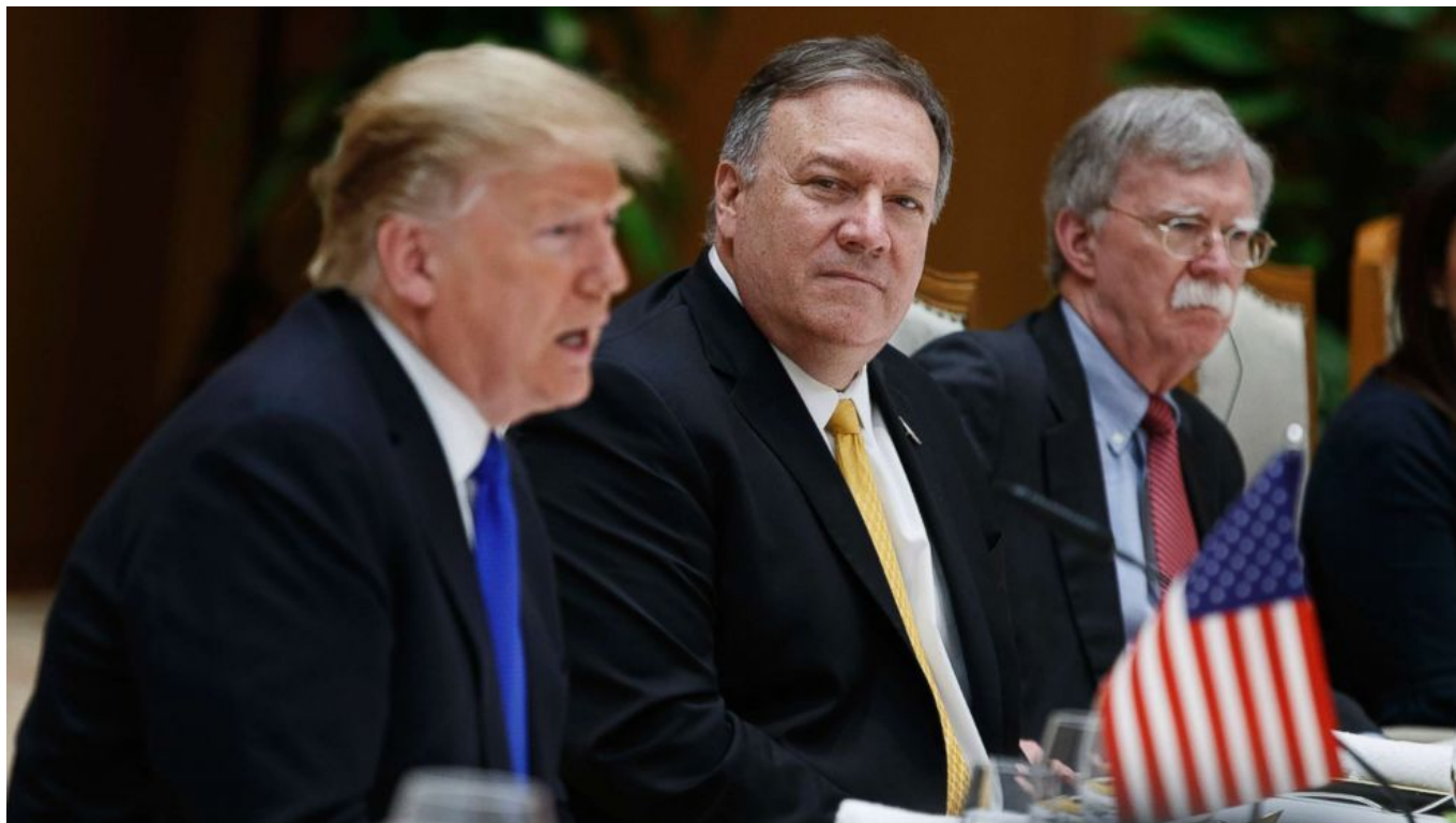
Trump, Pompeo and Bolton.