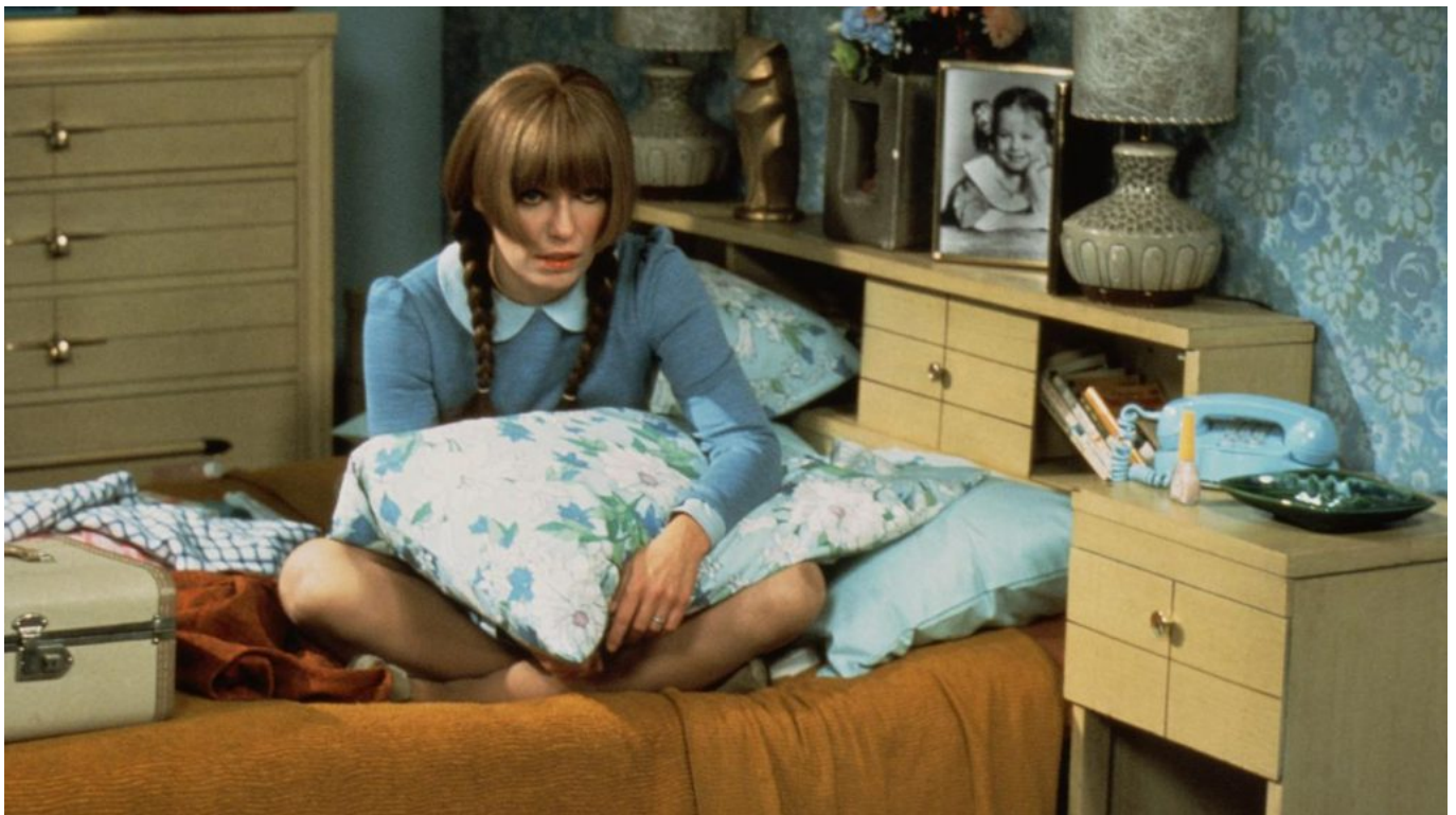
Mary Hartman. Mary Hartman.

A more insightfully absurd and comically astute series has not been made. Mix the daily grind of ALL MY CHILDREN, the experimentation of MONTY PYTHON, the self-absorbed and urbane existentialism of WOODY ALLEN and the offbeat quality of BLUE VELVET and you have MARY HARTMAN MARY HARTMAN.