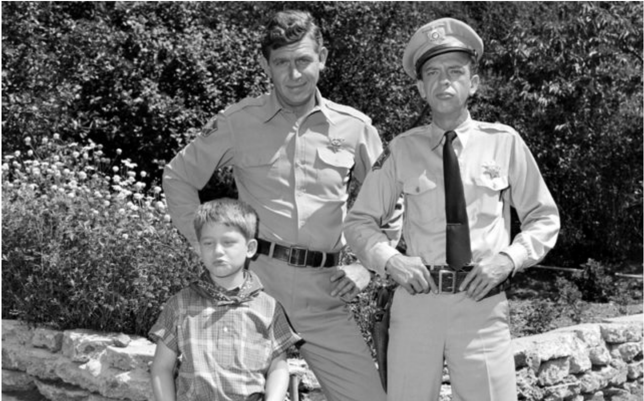
The Andy Griffith show.

This sitcom was spun-off from an episode of The Danny Thomas Show. In that show, Danny Thomas was arrested in a small North Carolina town. The character of the small town sheriff turned out to be so popular that they made a complete show around him.