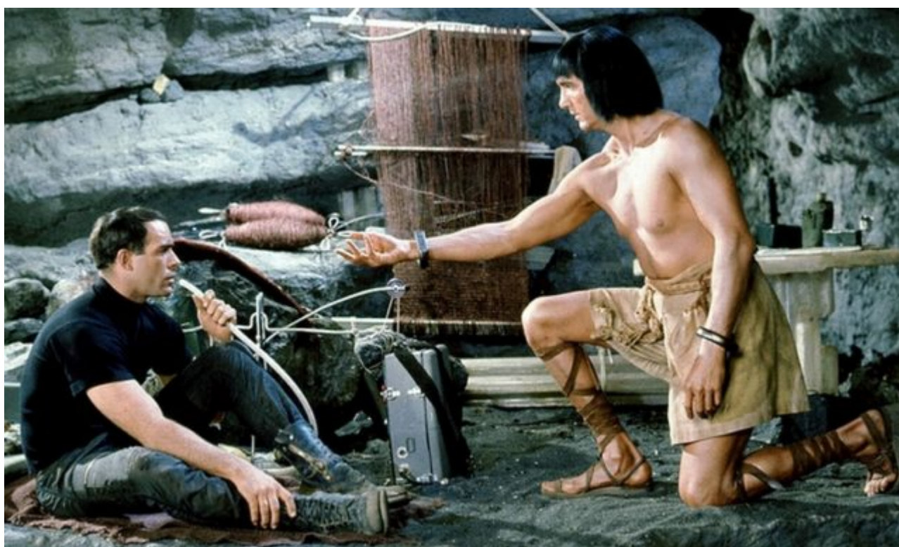
Robinson Crusoe on Mars (1964)

"Special-effects wunderkind and genre master Byron Haskin ( The War of the Worlds , The Outer Limits ) won a place in the hearts of fantasy film lovers everywhere with this gorgeously designed journey into the unknown."