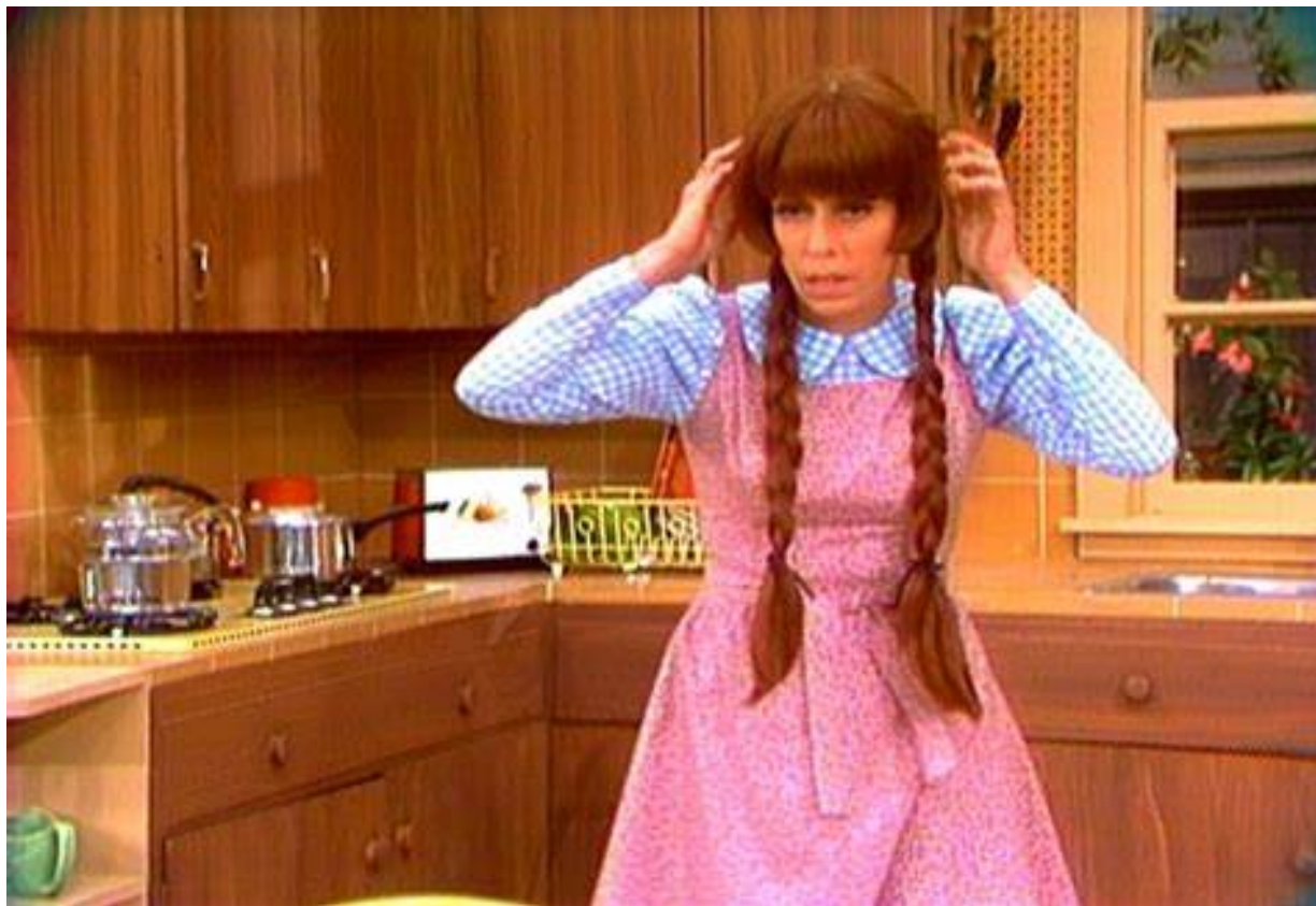
Mary Hartman. Mary Hartman.

Set in fictional Fernwood, Ohio, this deliriously demented serial focused on the beleaguered heroine Mary Hartman, an average American housewife. In the first season, Mary suffered the travails of mass murder, adultery, venereal disease, homosexuality, religious cults, and UFO sightings, before she finally succumbed to a nervous breakdown on a syndicated talk show.