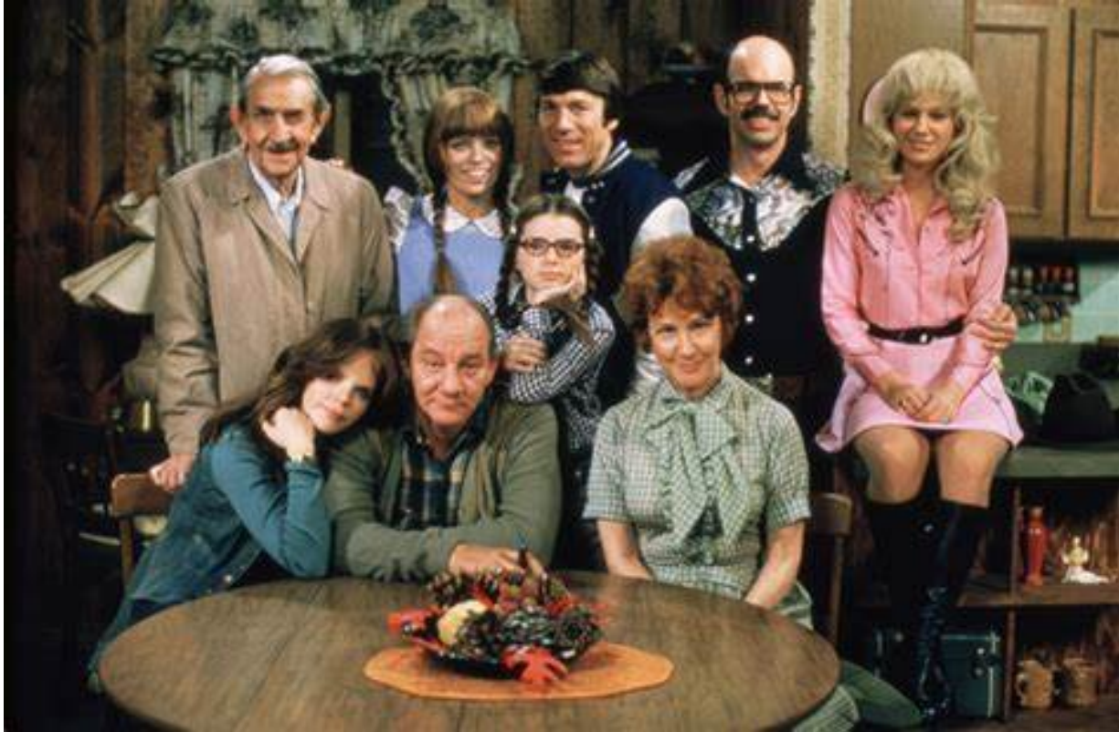
Mary Hartman. Mary Hartman.

Her confrontations with adultery, contemporary feminism, and countless other social issues (often found within her own family) while trying to be the perfect little housewife and mother makes her eventual nervous breakdown more than just another crazy plot twist.